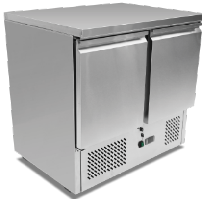
Two Doors Table Saladette