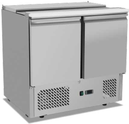
Two Doors Sliding Lid Saladette