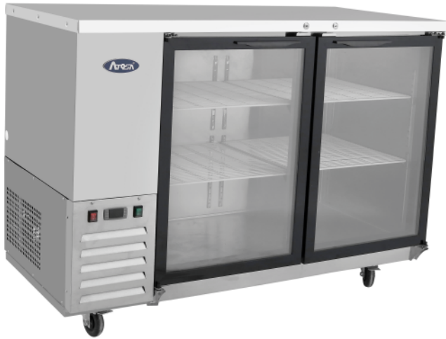
Refrigerated Back Bar Cooler with Glass Door