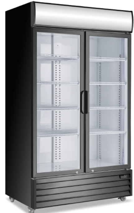
Hinged Door Cooler (Fan Cooling)